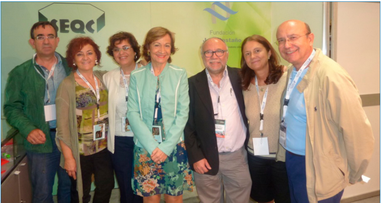
SEQC Executive Board Members