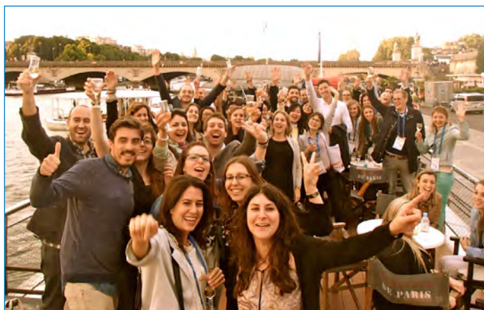
IFCC-TF-YS Evening Cruise – 23 June 2015