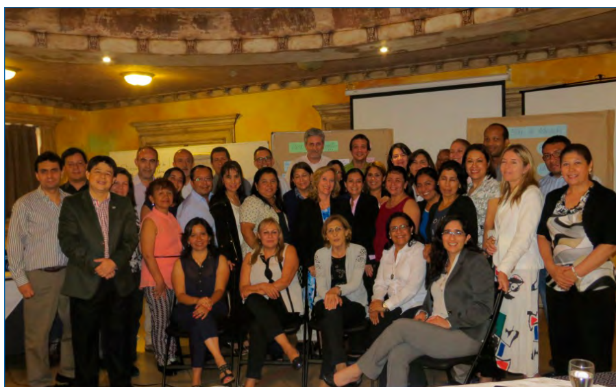
Workshop attendees: “Exchange of experiences about the interpretation of the ISO 15189”, 12-15 May 2015, Guatemala City, Guatemala