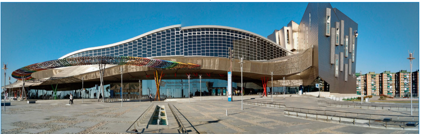
A view of the Trade Fairs and Congress Center of Málaga (FYCMA)