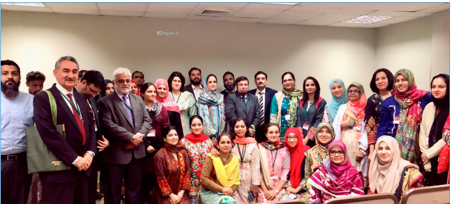
Participants at Chemical Pathology Symposia 'Metabolic Medicine' at PAP 2017

In the chemical pathology sessions, 12 free papers and 33 posters were presented by trainees and consultants including Pakistan Society of Chemical Pathologists (PSCP) members from all over Pakistan. Young researchers were encouraged for their active participation and best oral and poster awards were presented to 12 young researchers from different areas in the closing ceremony. The conference was attended by more than 1000 participants from around the country. The conference provided a concise and practical overview of latest advances in the field of laboratory medicine.